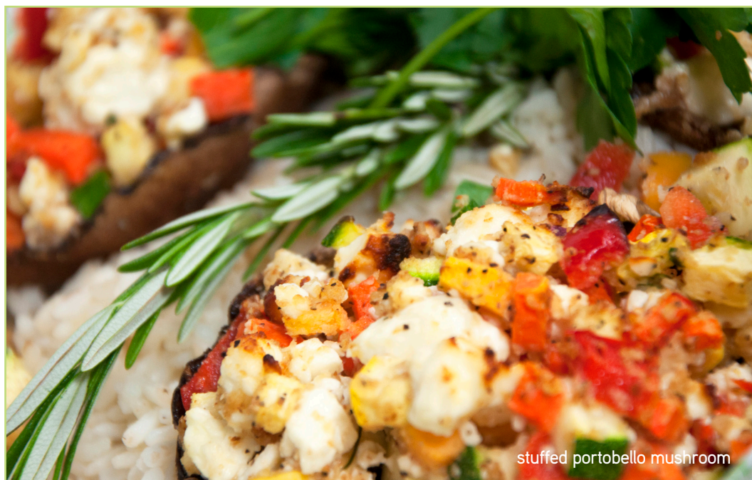
stuffed portobello mushroom