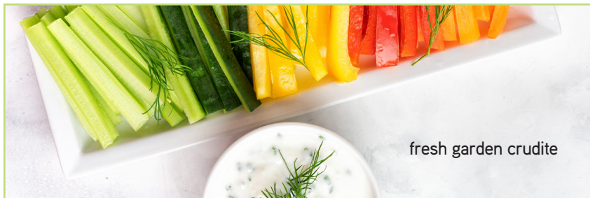
fresh garden crudite

priced per platter | small serves up to 15 people | large serves up to 30 people