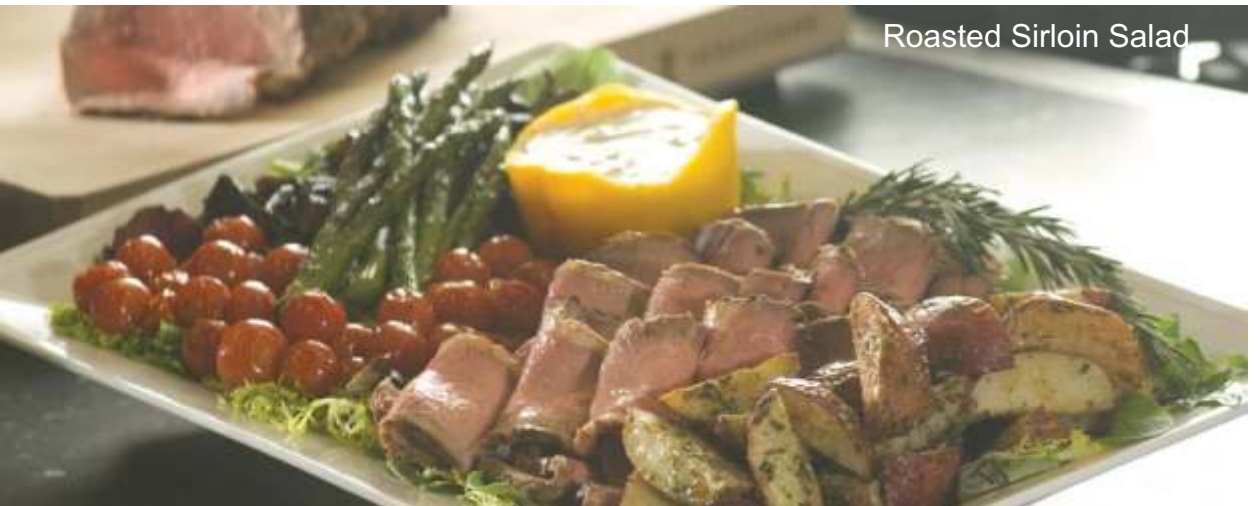
Roasted Sirloin Salad