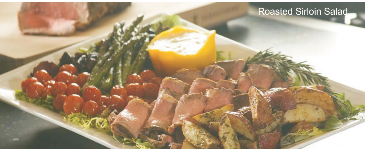
Roasted Sirloin Salad